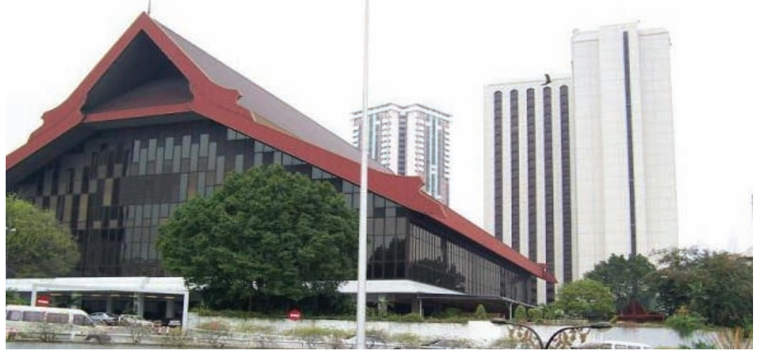
PUTRA WORLD TRADE CENTRE (PWTC) KUALA LUMPUR, MALAYSIA