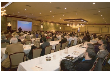
Connect with industry leaders

The website features on-line advertising, Conference Attendee Registration, Travel and Accommodation information.