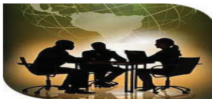
Broker major deals and get more orders

The show offers a wide spectrum of products and services including latest technology, latest products, new innovations, latest discoveries in agriculture and business solutions for the unique needs and requirements of the agricultural sectors. It will further enhance closer ties and transfer of technology with agricultural ministries and Agencies of the World for sustainable agricul-